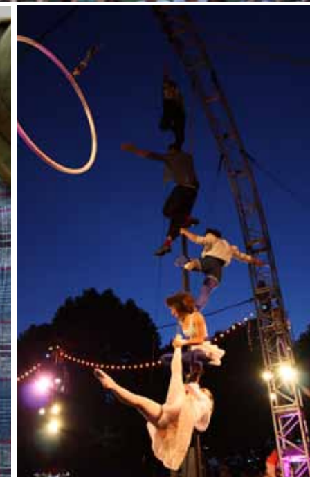
Circus Space 3rd Year BA (Hons )Degree students perform at Watch This Space, National Theatre, Southbank